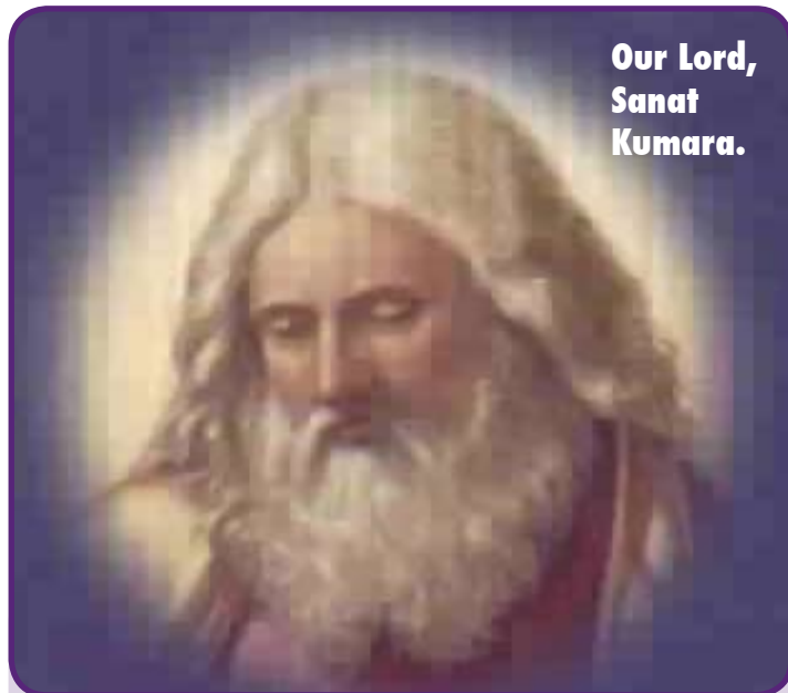
Our Lord, Sanat Kumara.

It was not long thereafter that the first group of volunteers left Venus to prepare a place for him on