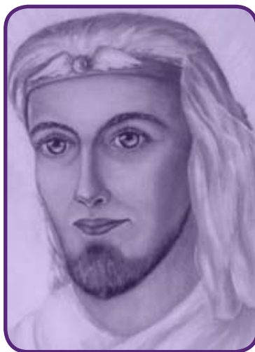
Beloved Serapis Bey of Luxor.

By that time, through practice, my love had grown stronger, and I was able to give that assistance to life, amplifying the natural perfection in