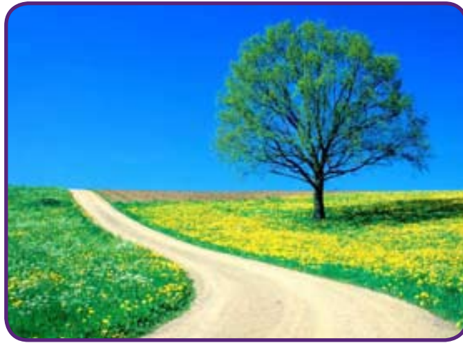
'Earth in herself is sweet.'

It has been a long, long time that the queen of love has reigned alone, acting as man and woman, a father and mother, to an evolution so magnificent and so beautiful that discord of any kind is unknown in her realm. Not one electron drawn from the universal has ever been qualified imperfectly there, by angel, elemental, or the evolution that is parallel to the