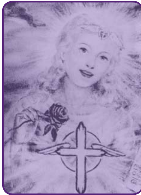
Ascended Lady Master Nada.

Then, there came to me an experience that filled my entire life and took from me that sense of diffidence and of “not belonging”. One night as I lay in my small bed, which was close to the windows, as I was looking out at the formal garden a lovely lady appeared on the balcony, dressed in beautiful rose pink. Her long hair was plaited, one plait hanging over the shoulder, and she smiled at me such, such kindness! It was the first time in that embodiment that anyone had taken any special note of me as an individual. As I looked at her, I was filled